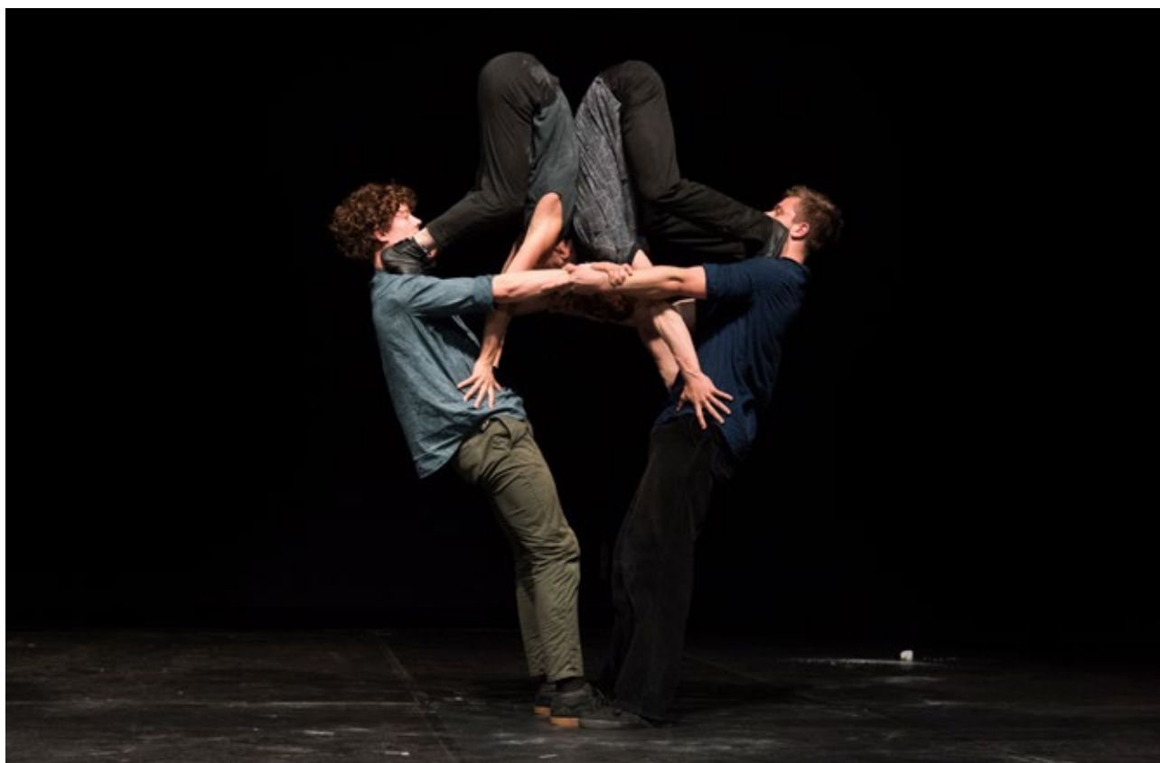
Familiar Faces – Not sure where this came from