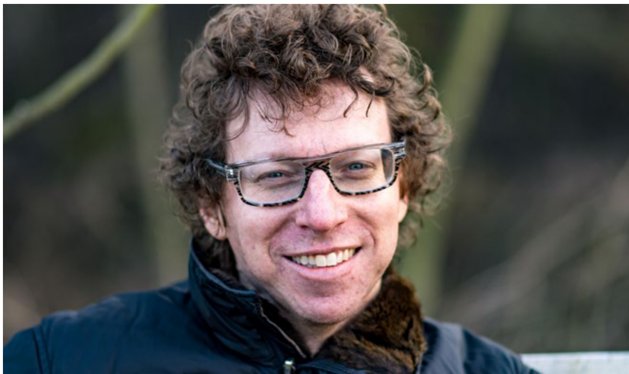
Arnon Grunberg – Manifest van Intimiteit