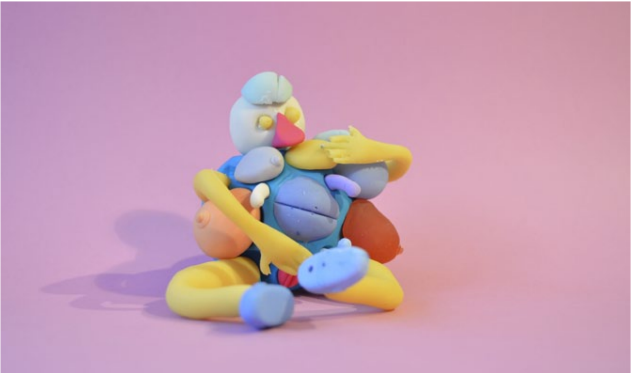
Parts to play with (2016) – Janne Schimmel