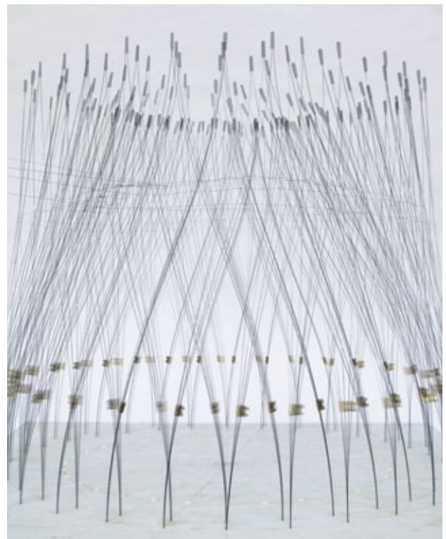
Mechanische Balts (2016) – Joost Gehem & Tidde Bakker Photo by Joost Gehem & Tidde Bakker