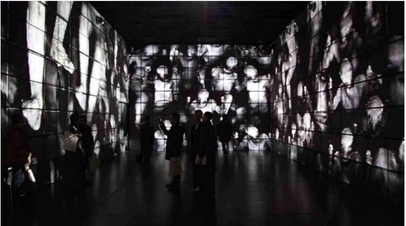
Caged (2013) – Bart Hess