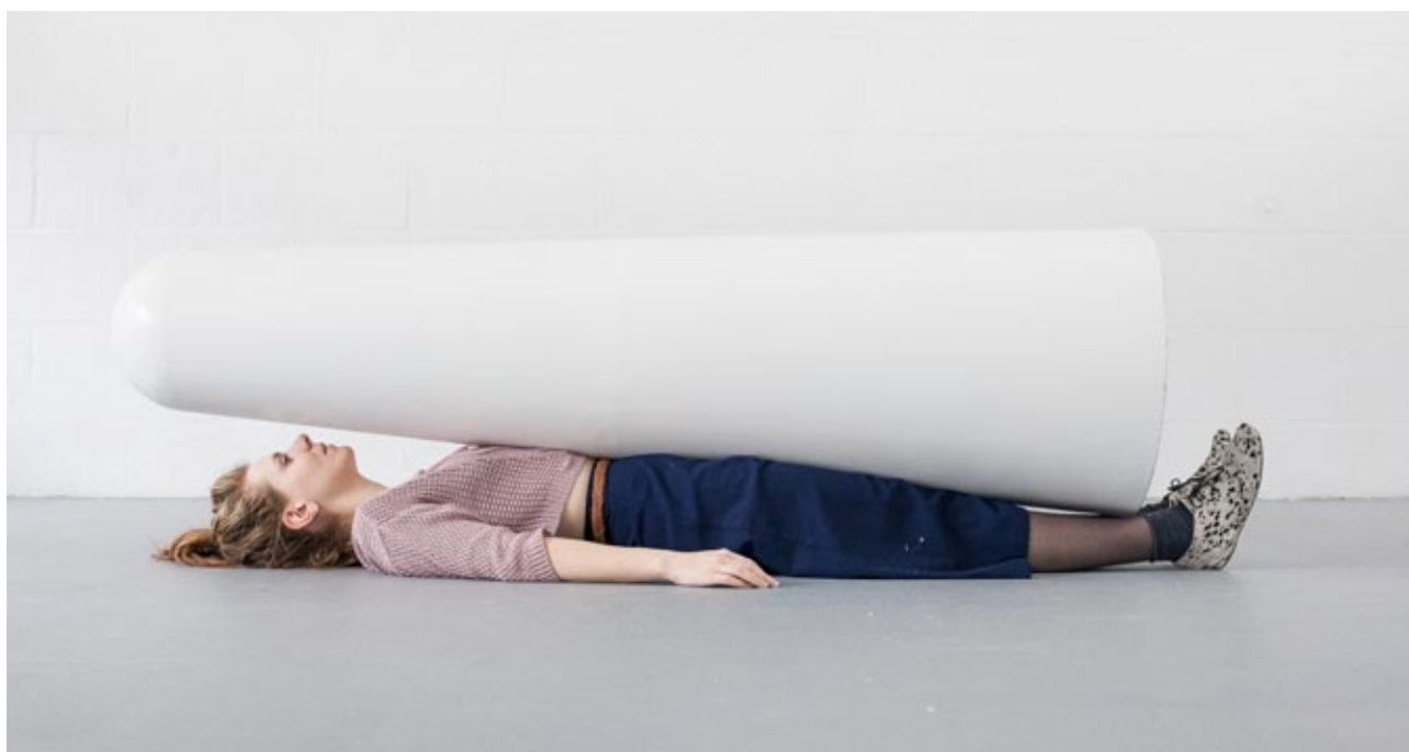
Him (2015) – Merel Stolker