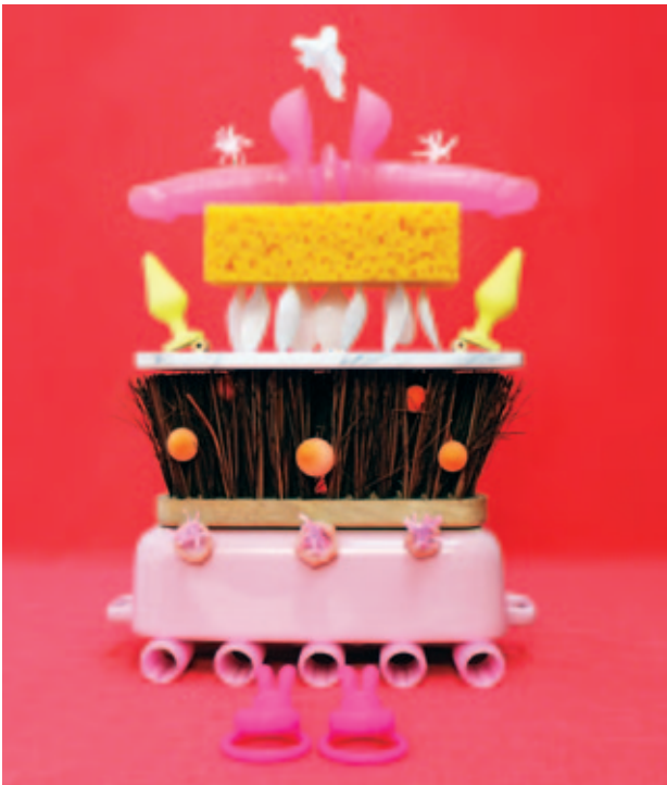
Invitation image – Studio Pluis