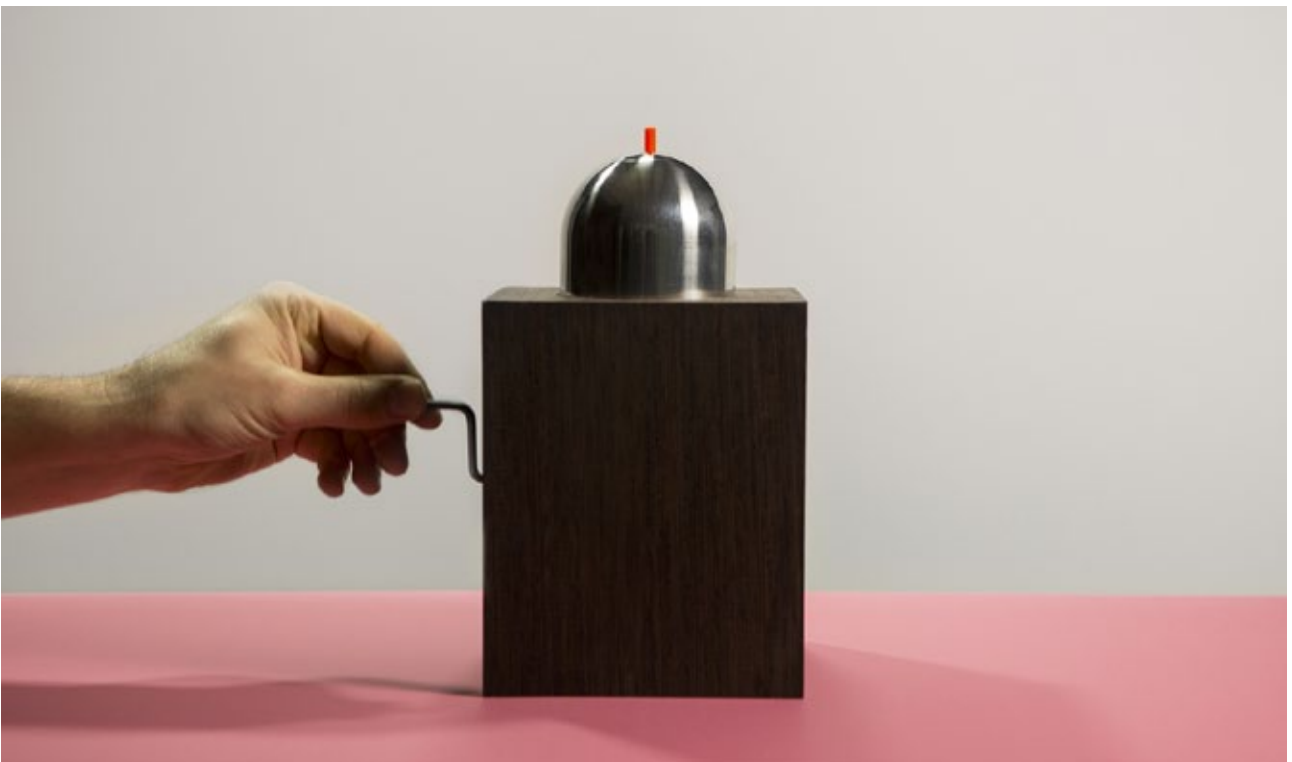
Autoeromatons – HeyHeydeHaas