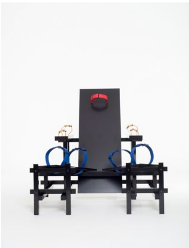
BDSM ICON CHAIR (2016) – Bastiaan Buys