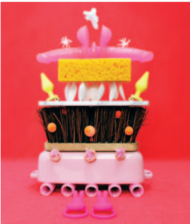
Invitation image – Studio Pluis