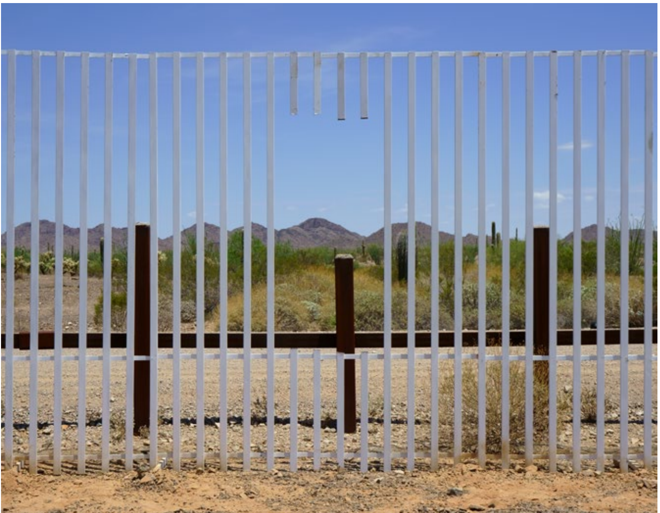
Brad Downey Fence Hack Five