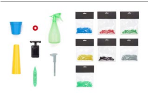
Lucas Maassen & Raw Color - D/Struct