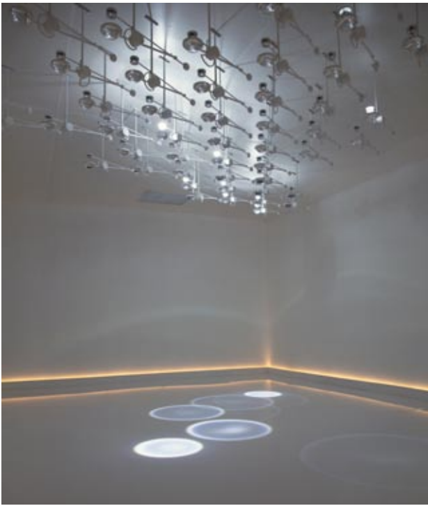
Troika - Falling Lights (installation view)