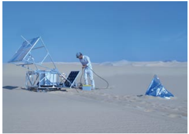
Markus Kayser - Solar Sinter