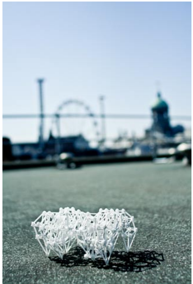
Theo Jansen - 3D printed Strandbeest