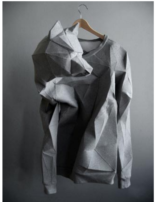
The T-Shirt Issue – Digital portraits