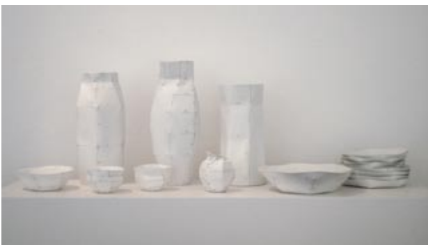
Ruth Gurvich – MAT porcelain